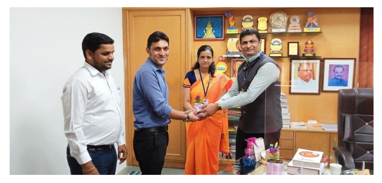
Institute signed MOU with Global talent Track Company.